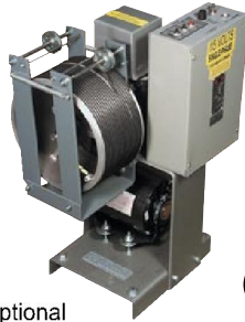
Shown With Optional Cable Tension Device.